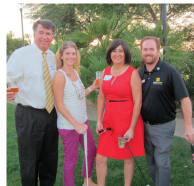
Annual Alumni Putt-Putt Mixer. The team winner of the 9-Hole putting challenge were treated to Starbucks gift cards, topped off by a surprise hole-in-one to start (and end) the closest to the pin putt challenge.